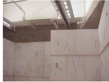
Uncovered fixed-wires are followed by sight