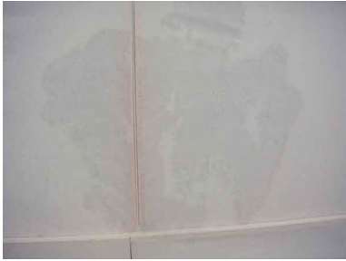
Shoji paper are sanded, there are vanish stains from place to place