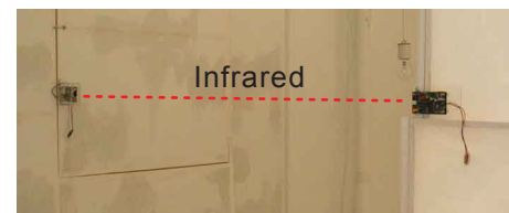
Infrared sensors When visitors cut infrared by to pass between infrared sensors, a bulb conected with sensor is turned on and after 4 sec. it is turned off automatically