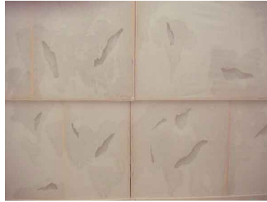
Shoji paper are fixed on both sides on flames, paper are ripped out at intervals on one side